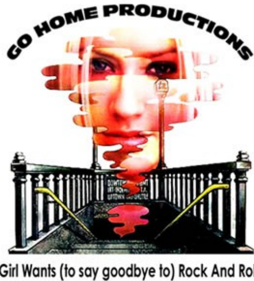
Figure 3: Mark Vidler's mashup graphic