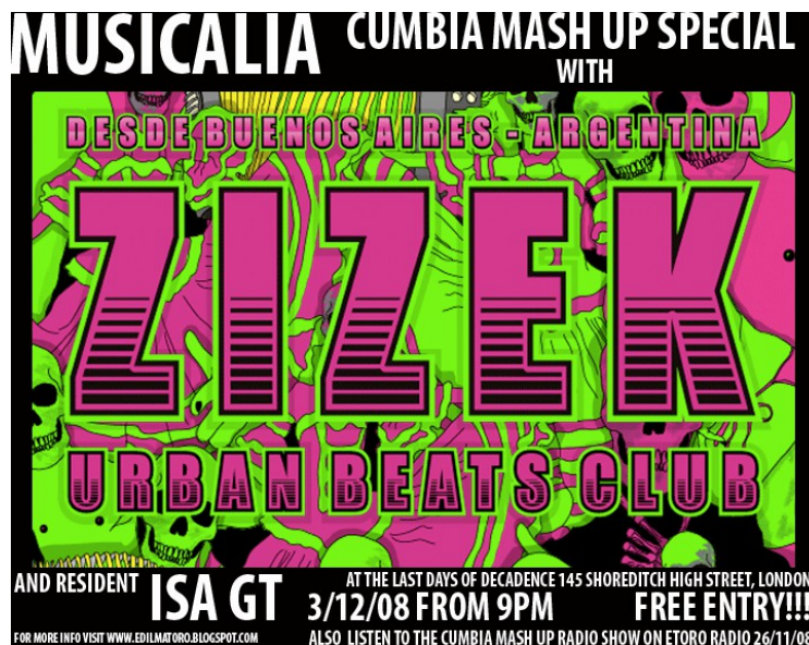
Figure 1: Flier for a Zizek Urban Beats Club show

its own mashup of Žižek, and everything that the name entails and encompasses, with the sounds, practices, and culture of contemporary dance music (Hernandez 2010, 136). And what can be perceived in this unlikely combination of two apparently disparate and incompatible sources is something that exceeds the comprehension of both, opening each to previously unheard of opportunities. Consequently, the thesis of this essay can be stated quite directly: Slavoj Žižek, despite having little to say about mashups in any direct way, engages this new media phenomena in both theory and practice, providing contemporary culture with both a conceptual understanding of the mashup and a carefully executed illustration of its methodology. The examination of this will proceed by way of two movements. The first investigates how Žižek's work, especially his general interest in "short circuiting," provides theoretical insight for understanding the mashup and its cultural significance. The second turns things around, demonstrating how the mashup explains and describes Žižek's own compositional practices. In other words, the first part explains the mashup by way of Žižek, while the second explains Žižek by way of the mashup.