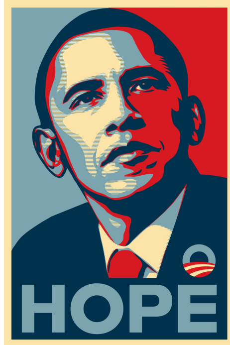
Figure 2: Shepherd Fairey's "Hope" poster

Although fabricating a mashup sounds relatively easy, getting it right is more difficult than it initially appears. "A lot of people," Burton explains, "just assume I took some Beatles and, you know, threw some Jay-Z on top of it or mixed it up or looped it around, but it's really a deconstruction. It's not an easy thing to do" (Rimmer 2007, 132). In recombining The Beatles with Jay-Z, Burton did more than just rearrange prefabricated audio components. It is, as he points out, a calculated and critical intervention into the material of popular music, creating what Žižek has termed a "short circuit."